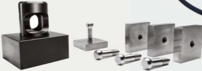
PosiTest AT 50T KIT measures the tensile strength of ceramic tile adhesives.