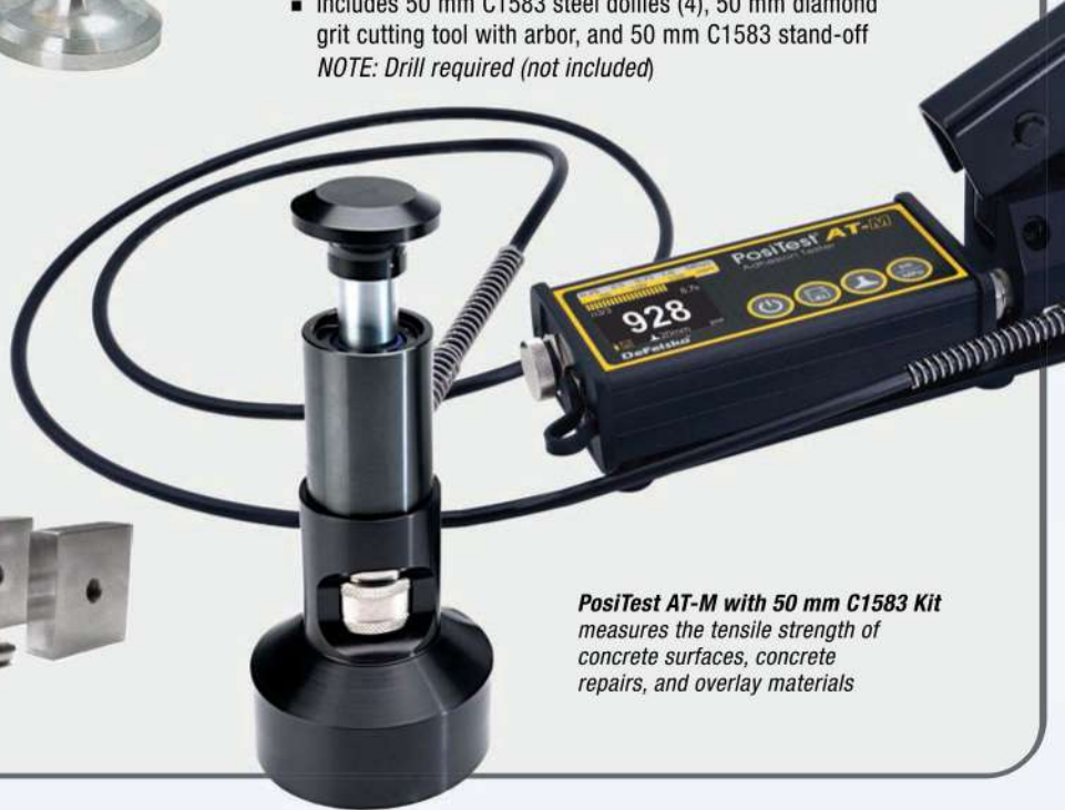
PosiTest AT-M with 50 mm C1583 Kit measures the tensile strength of concrete surfaces, concrete repairs, and overlay materials