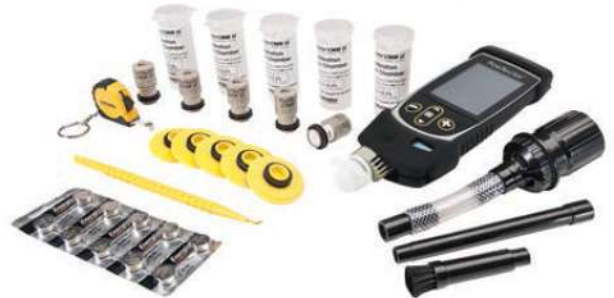
PosiTector CMM IS Pro Kit includes the PosiTector DPM Advanced

Replacement chambers, salt solutions, tools, caps, stackable probe extensions, and fins are available upon request