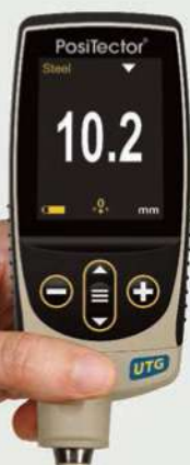
UTG CA for one-handed operation

Measures the wall thickness of materials such as steel, plastic, and more. Ideal for measuring the effects of corrosion or erosion on tanks, pipes, or any structure where access is limited to one side.