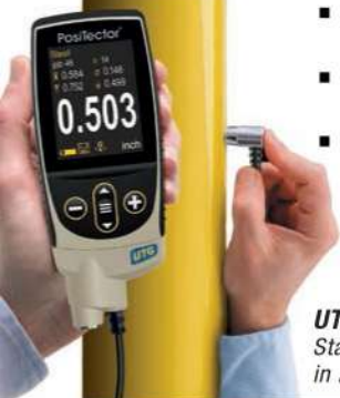
UTG M1 Standard model in memory mode