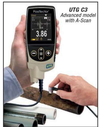
UTG C3 Advanced model with A-Scan