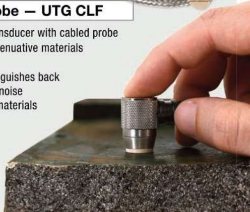
UTG CLF for cast materials