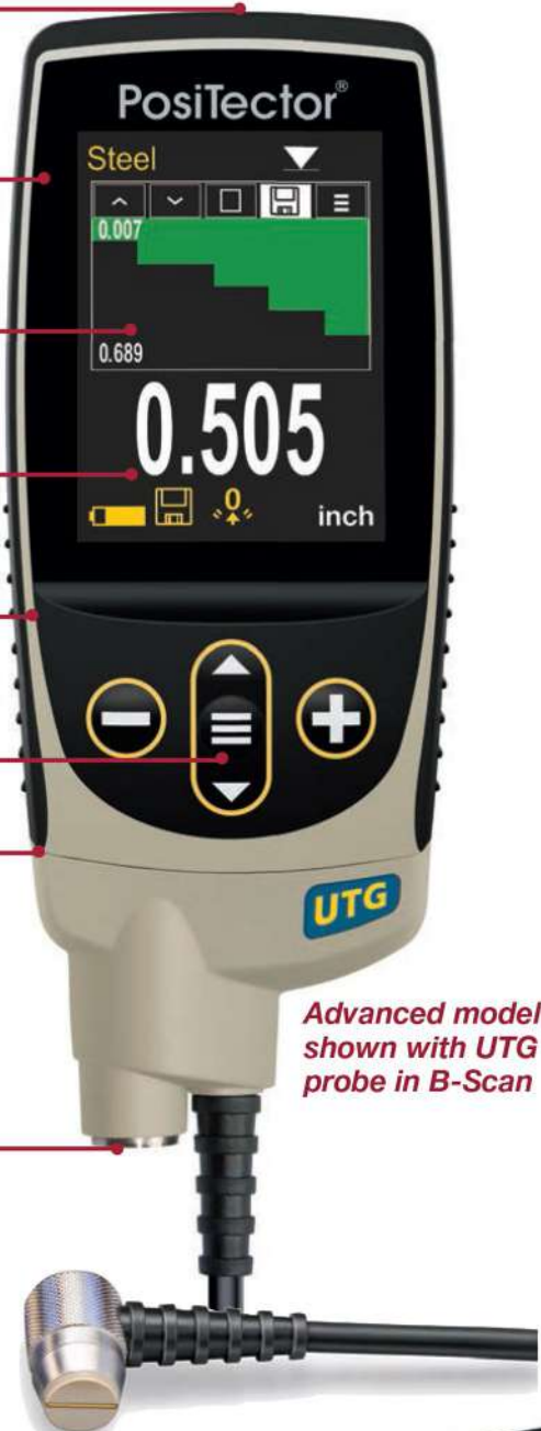
Advanced model shown with UTG C probe in B-Scan