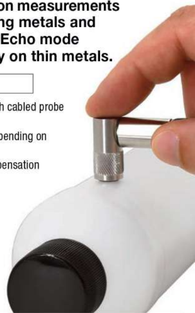
UTG P for high resolution and thin materials