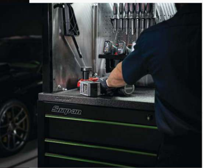
KCP1422 55" 10-Drawer Classic Series Roll Cab with Workcenter

As tools have advanced, so have the ways to store them. Snap-on® tool storage units deliver unsurpassed efficiency and organization. Lights to make it easier to see inside the drawers. Convenient charging for power tools and other devices. Endless options for bulk storage overhead and in lockers that ensure security and keep your most frequently used tools instantly available. We also stay ahead of the curve with unique paint colors and trim options that make personalization easy. This is tool storage designed with the future in mind.