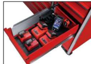
KMP1099 Includes PowerDrawer with (5) outlets and (2) USBs (tools not included)