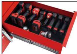
KMP1099 Includes power tool organizer drawer (tools not included)