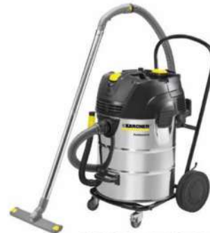
NT 75/2 Ap Me Tc