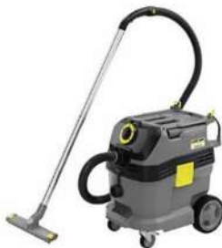
NT 30/1 Tact L