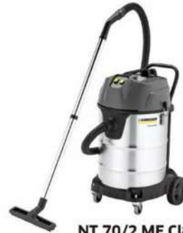
NT 70/2 ME Classic