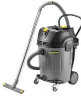
NT 65/2 Ap