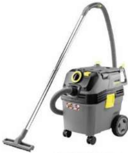
NT 30/1 Ap L