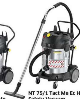
NT 75/1 Tact Me Ec H Z22 Safety Vacuum