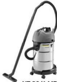
NT 38/1 ME Classic