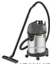
NT 30/1 ME Classic