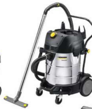
NT 75/2 Tact² Me