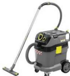
NT 40/1 Tact Te L