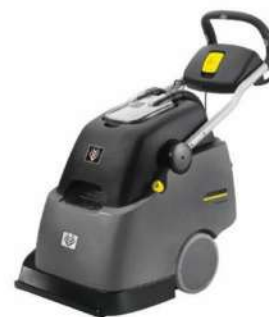
BRC 45/45 C