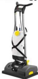
BRS 43/500 C