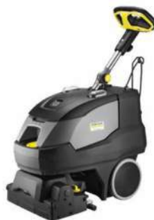
BRC 40/22 C