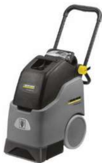
BRC 30/15 C