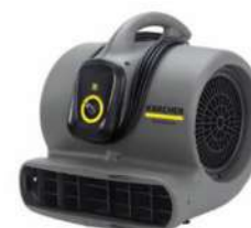
AB 30 Classic Blower