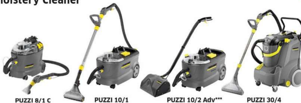
PUZZI 8/1 C