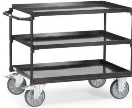
4830/7016 | 4832/7016