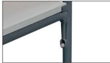
Reinforcement struts increases the capacity of inserted shelves.