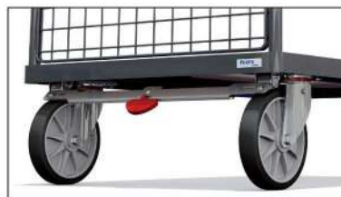
TOTALSTOP - the fetra central brake system With only one foot the rotation of wheels and the swivelling movement of both swivel castors can be securely locked. The brake pedal is always visible to the operator. Standard with TOTALSTOP.