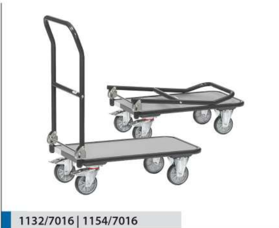
1132/7016 | 1154/7016