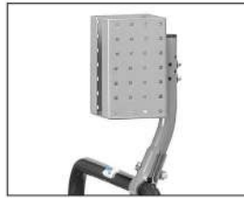
Scanner holder For details see page 185.