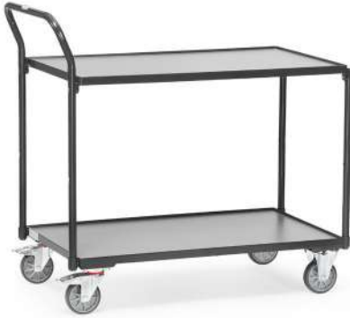
2740/7016 | 2742/7016