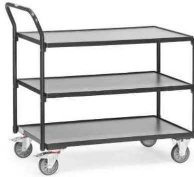
2750/7016 | 2752/7016