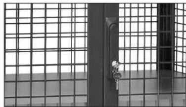
Vertical locking rod with turning lever and cylinder lock.