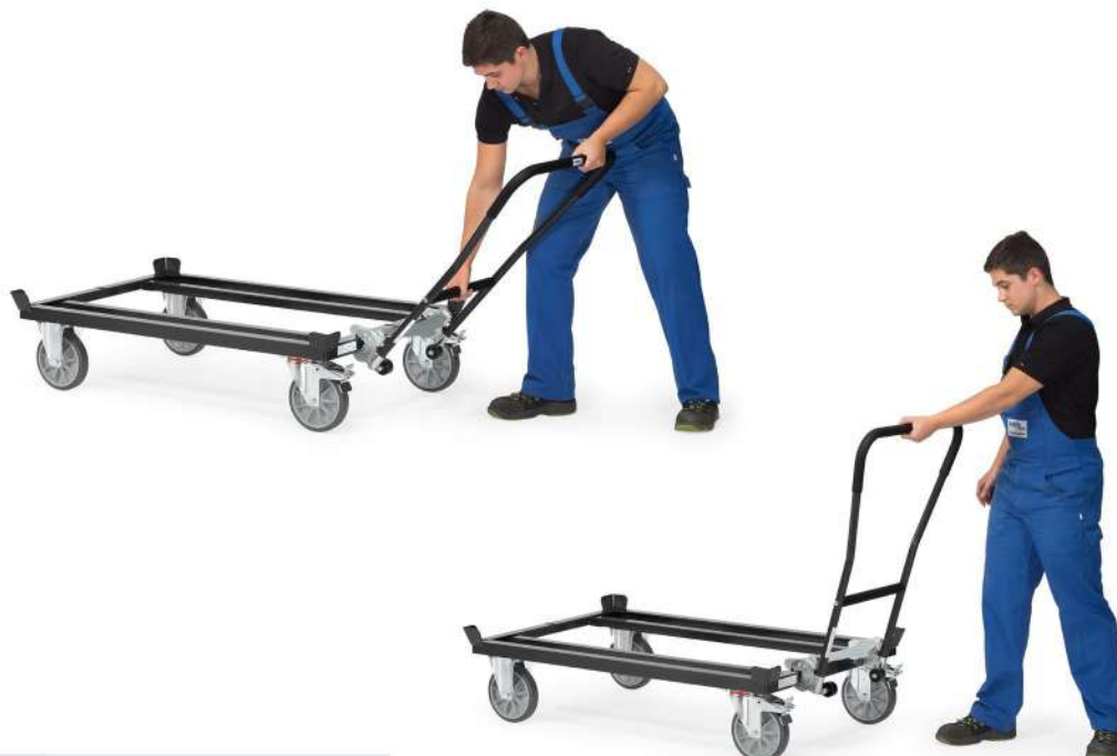
Example of use