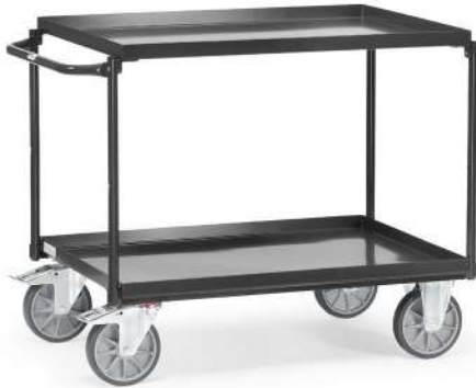
4820/7016 | 4822/7016