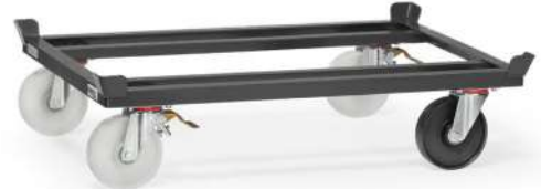
23891/7016 | 23892/7016