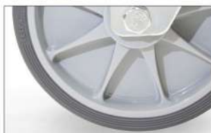
Table top cart 2402/7016

The innovative easy-running TPE-castor in the attractive fetra design is non-marking and odourless. Particularly smooth-running groove ball bearing.