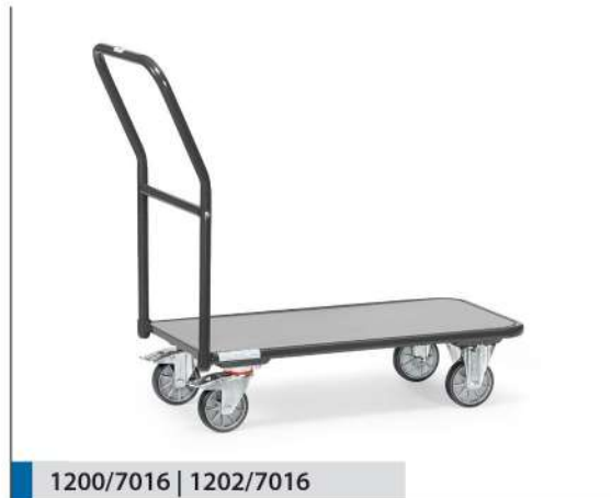
1200/7016 | 1202/7016