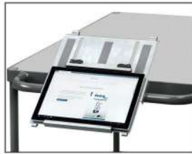
Tablet holder For details see page 185.