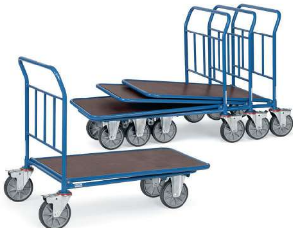
2960 | 2961 | 2962