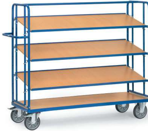
4255 | 4256