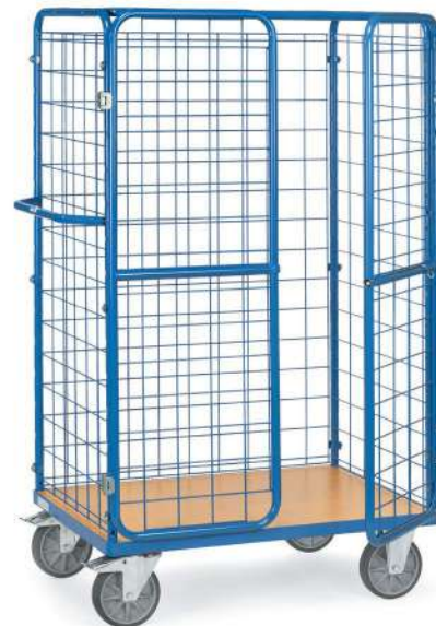
8581-3D | 8582-3D | 8583-3D