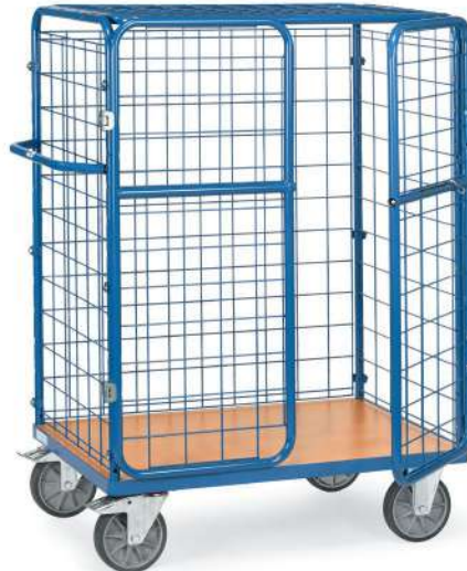
8481-3D | 8482-3D | 8483-3D