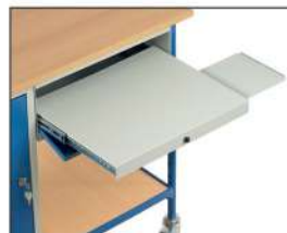
Detailed view keyboard drawer for rolling table 5866.