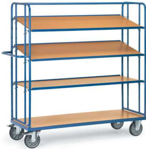
4395 | 4396