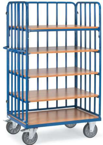
8351-1 | 8352-1 | 8353-1