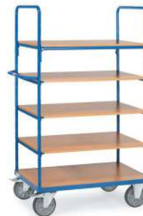
8341 | 8342 | 8343