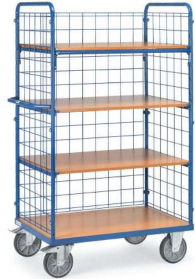
8411-1 | 8412-1 | 8413-1