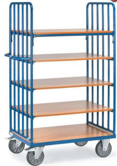
8351 | 8352 | 8353