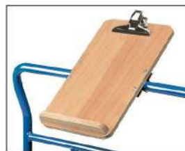
Clip board upright DIN A4