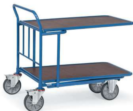
2970 | 2971 | 2972