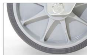
Parcel cart 8582-1

The innovative easy-running TPE-castor in the attractive fetra design is non-marking and odourless. Particularly smooth-running groove ball bearing.