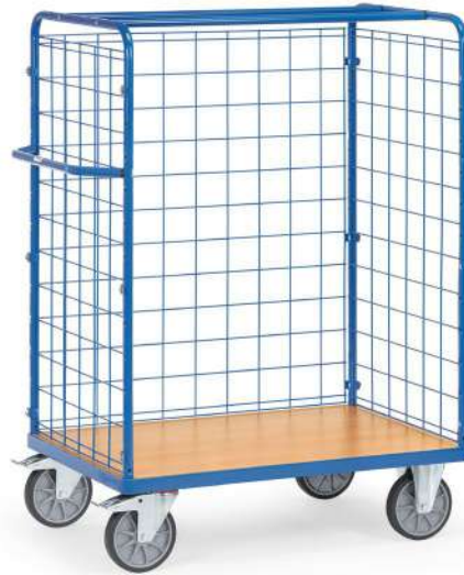
8481-1 | 8482-1 | 8483-1

Total height/Useful height 1552 mm/1280 mm 1800 mm/1530 mm