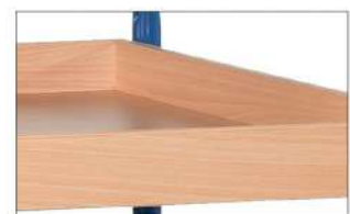
Shelved trolley 8302

High-quality workmanship, box height 60 mm, capacity 120 kg per box.