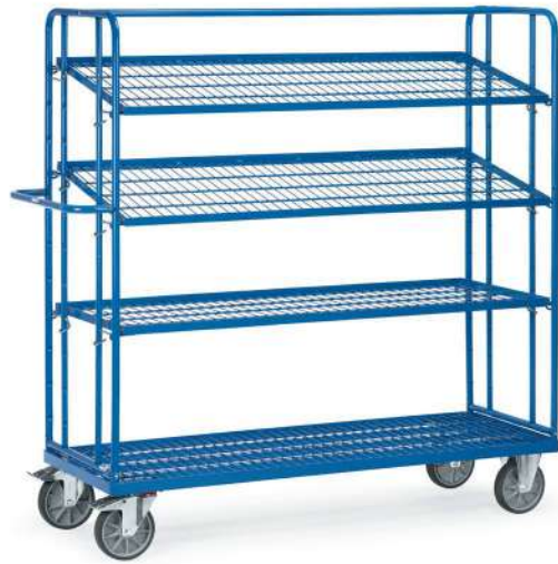
4495 | 4496