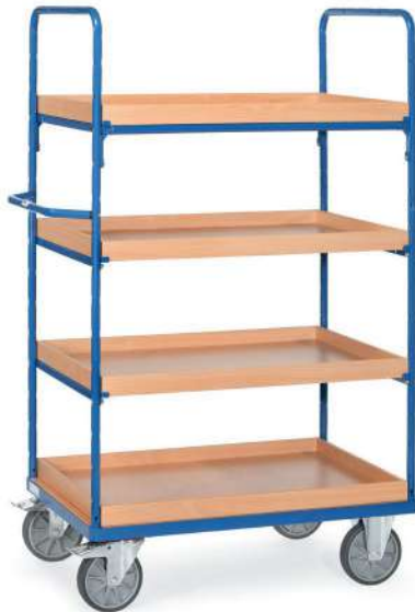
8321 | 8322 | 8323