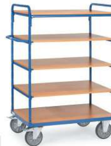
8240 | 8241 | 8242 | 8243