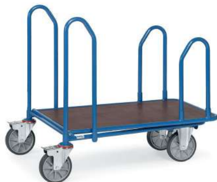
2980 | 2981 | 2982

For small items, 600 x 140 x 200 mm. See also page 185.