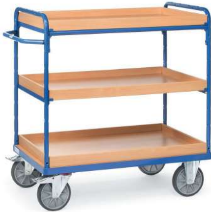
8120 | 8121 | 8122 | 8123