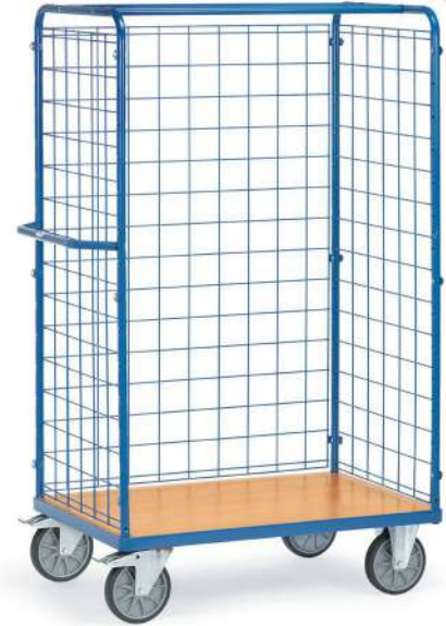
8581-1 | 8582-1 | 8583-1