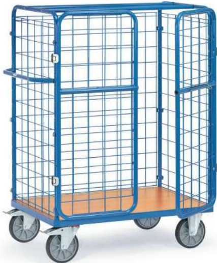
8481-3 | 8482-3 | 8483-3