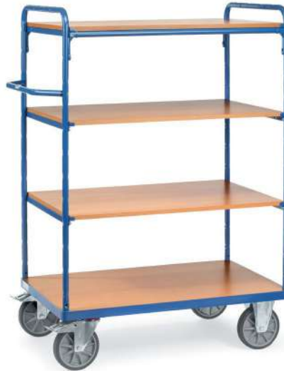
8200 | 8201 | 8202 | 8203