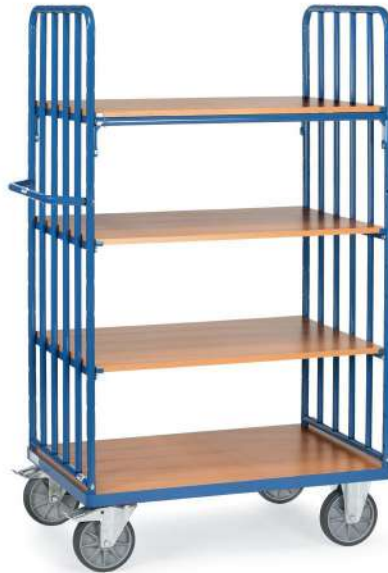
8311 | 8312 | 8313