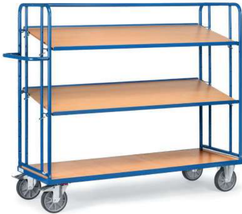
4295 | 4296