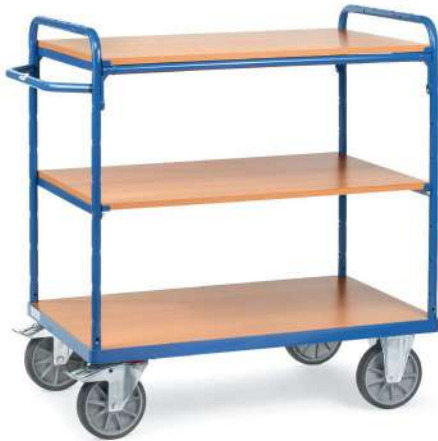
8100 | 8101 | 8102 | 8103