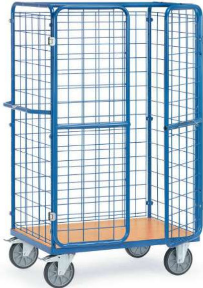
8581-3 | 8582-3 | 8583-3