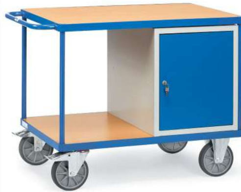
2432 | 2433