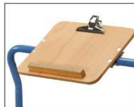
Clip board broadsize DIN A4