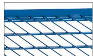
Shelved trolley 4296

Alternatively with wire lattice: Permeable and insensitive to dirt.