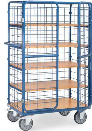
8581-3DE | 8582-3DE | 8583-3DE