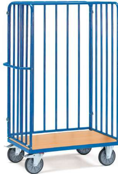
8381-1 | 8382-1 | 8383-1