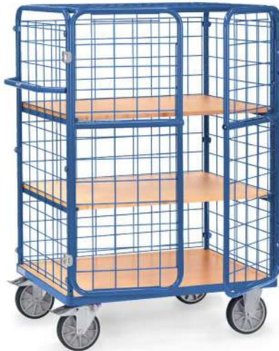
8481-3DE | 8482-3DE | 8483-3DE