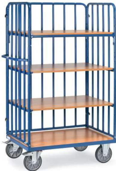
8311-1 | 8312-1 | 8313-1

Capacity per shelf is 150 kg instead of 90 kg.