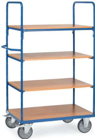
8301 | 8302 | 8303