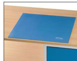
Blotting pad For the table board, blue, size 485 x 485 mm.