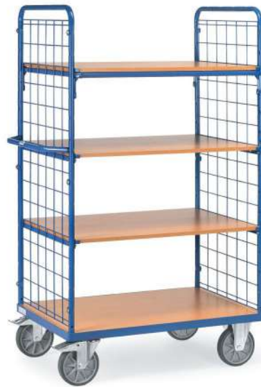
8411 | 8412 | 8413