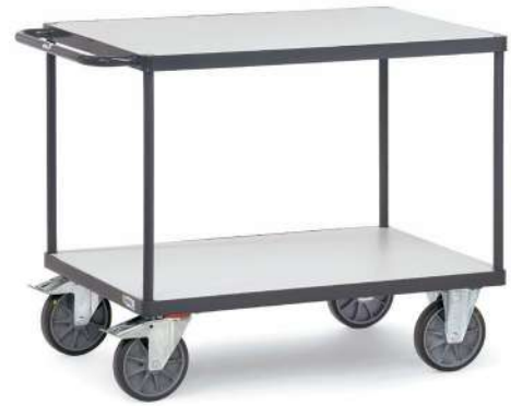
9400 | 9401 | 9402 | 9403