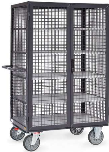
9392 | 9393