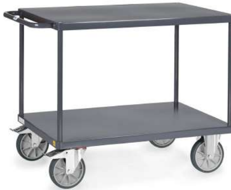
9400B | 9401B | 9402B | 9403B