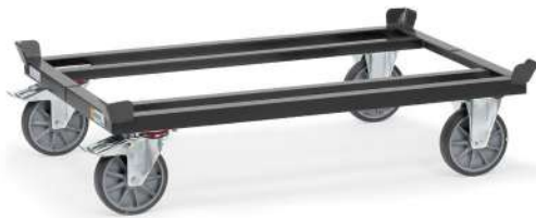
23799 | 23800 | 23801 | 23802