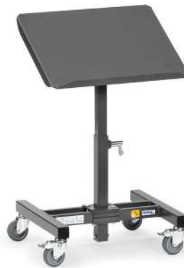
1891* | 1892*