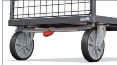
TOTALSTOP - the fetra central brake system With only one foot the rotation of wheels and the swivelling movement of both swivel castors can be securely locked. The brake pedal is always visible to the operator. Standard with TOTALSTOP.