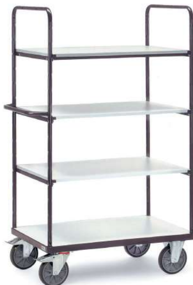
9301 | 9302 | 9303