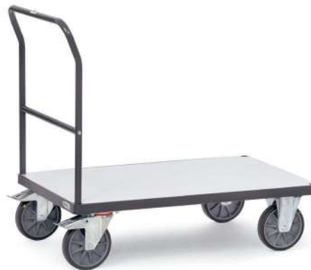
9500 | 9501 | 9502 | 9503