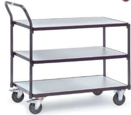
1850 | 1851