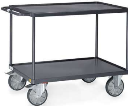
9400W | 9401W | 9402W | 9403W