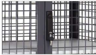
Vertical locking rod with turning lever and cylinder lock.