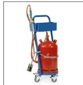
Example of use 51162