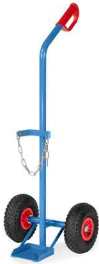
51091 | 51092