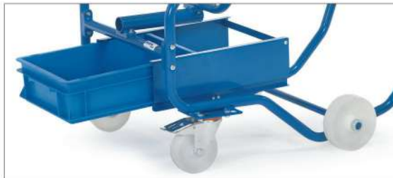
Oil drain pan 2019 As add-on kit for drum cradle 2015 and 2016, extricable. Plastic oil drain pan 12 litres content.