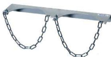
51214 | 51223 | 51232

Wall mounting for 1-3 steel bottles, bottle-Ø 140, 230 and 320 mm. Steel sheet construction, pre-drilled U-shaped rail for wall fixing, 1-3 bottle clamps, secured with chain, hot-dip galvanized.