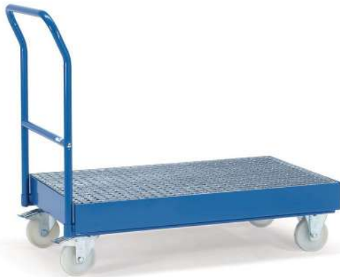
2702* | 2703*