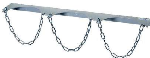
51314 | 51323 | 51332