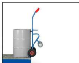
Trolley with drum in filling position.