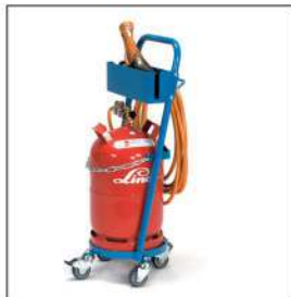
Example of use 51161