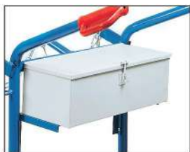
Tool box 51060