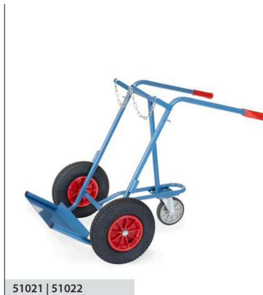
51021 | 51022