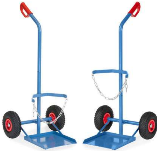
51121 | 51122