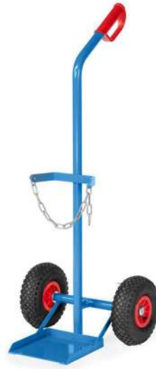
51101 | 51102