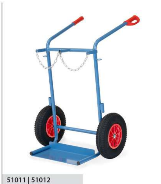
51011 | 51012