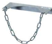
51114 | 51123 | 51132