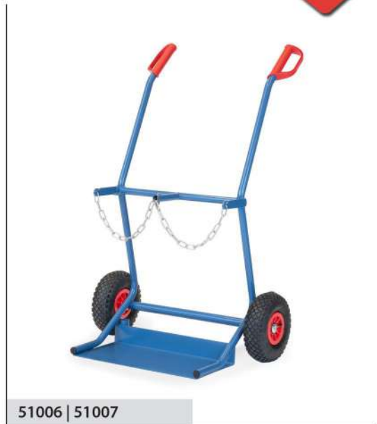
51006 | 51007