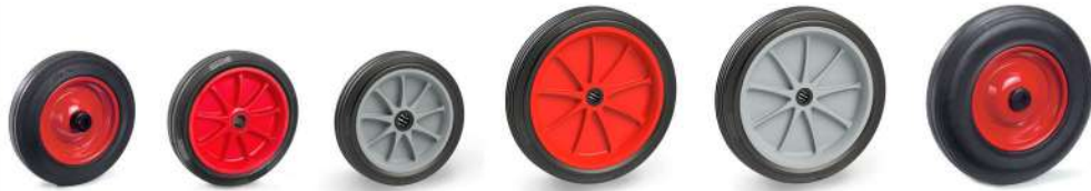
70211 | 70217 | 72217G | 72221R | 72221G | 71221

Dollies for furniture with platform made of plywood, non-slip. 4 swivel castors with polyamide wheels 125 mm Ø.