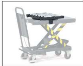
Roller conveyor with live ring.