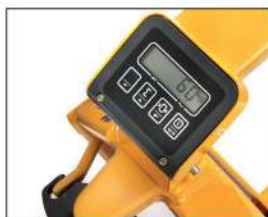
Pallet truck with scale