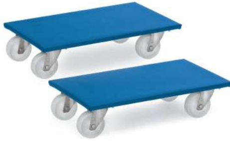
2350 | 2352