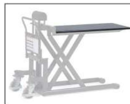
Attachable platform for skid lifter 6820 and 6821.