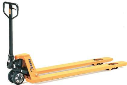
2116-15 | 2116-18 | 2116-20