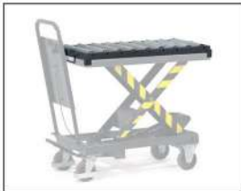
Roller conveyor with attachable frame.

Roller conveyor 6891 Can be fixed to platform with clamped joint, swivelling by 360°, arrestable. 6 steel rolls (Ø 57 mm and length 430 mm) with roller bearings. Distance between axles: 110 mm Height: 92 mm Carrying capacity 500 kg – swivelling –