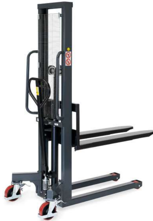
6855 | 6856