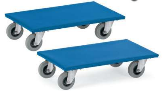
2351 | 2353