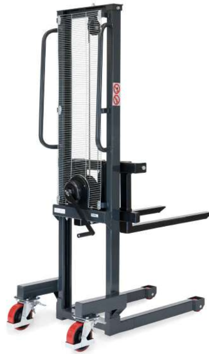
6851 | 6852