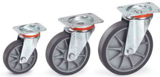
71602 | 71603 | 71604

Casings made of steel sheet, galvanized. Wheels with TPE tyres (thermoplastic elastomer). Plastic rims, hubs with ball bearing and thread protection. Very low starting, rolling and swivelling resistance. Wheels non-marking (trackless).