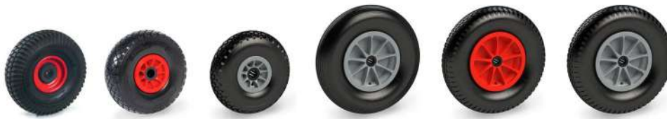
70611 | 70607 | 72607G | 72620G | 72621R | 72621G