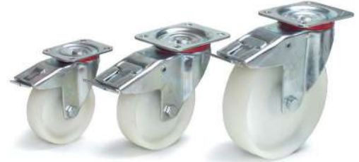
71512 | 71513 | 71514