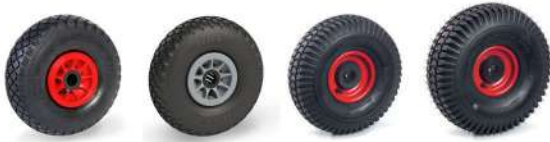
70107 | 72107G | 70111 | 70116