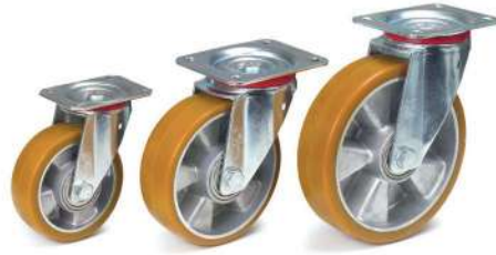
71302 | 71303 | 71304

Casings made of steel sheet, galvanized. Wheels with polyurethane tyres, alu-rims, hubs with roller bearings. Smooth, silent running, resisting to many aggressive media, long durability.