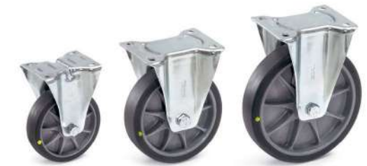
71472 | 71473 | 71474