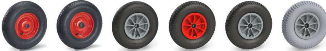
71120 | 71121 | 72120G | 72121R | 72121G | 72125G