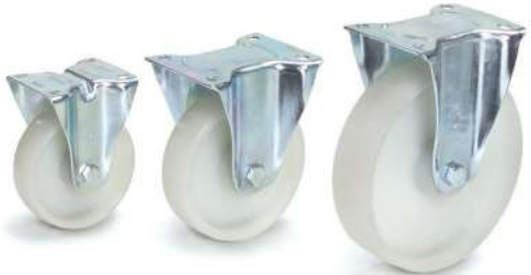
71522 | 71523 | 71524