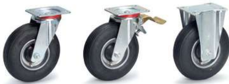
71505 | 71515 | 71525