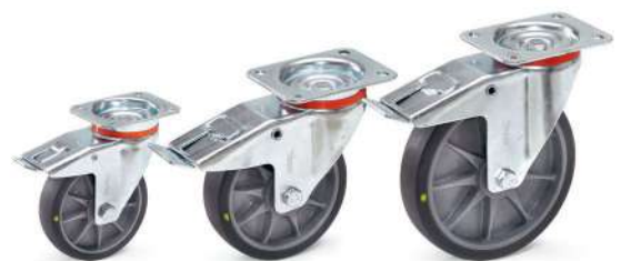
71462 | 71463 | 71464