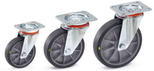
71452 | 71453 | 71454