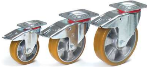
71312 | 71313 | 71314

Casings made of steel sheet, galvanized. Wheels like swivel castors.