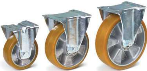
71322 | 71323 | 71324

Casings made of steel sheet, galvanized. Wheels like swivel castors