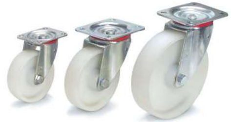
71502 | 71503 | 71504