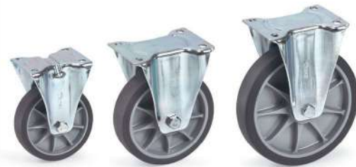
71622 | 71623 | 71624

Casings made of steel sheet, galvanized. Wheels like swivel castors.