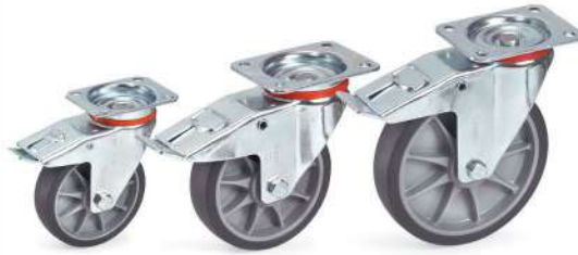
71612 | 71613 | 71614

Casings made of steel sheet, galvanized. Wheels like swivel castors.