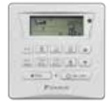
DSLMB Wired Controller